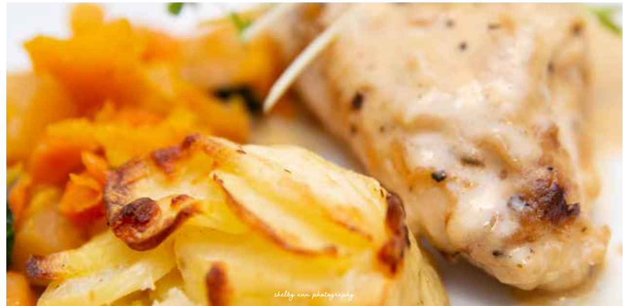
CHICKEN AU POIVRE