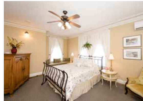
BALD HILL SUITE

A corner room with presidential blue walls featuring ample space, a classic fireplace, king-sized bed, private bath with deep claw foot soaking tub and marble sink.....$250.00