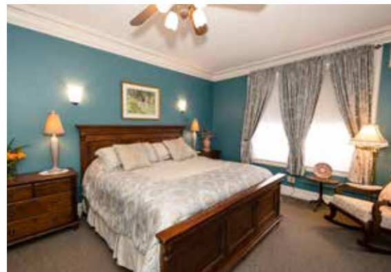
THE WENTWORTH ROOM

The gentleman's private abode with fireplace, substantial king-sized bed and writing area with a comfortable lounging couch. The bedroom features a large space with all amenities, tiled floor and a relaxing large walk-in shower.....$250.00