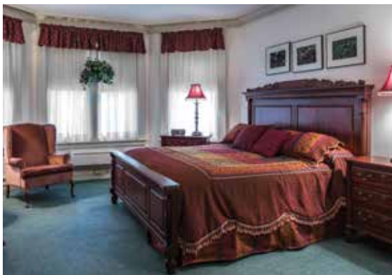
MR. BOWEN'S ROOM

A spacious suite overlooking the side garden, a center sitting room with fireplace and sofa with full-size pull-out, queen-sized bed, inviting window seat, and private bath with huge tiled shower.....$225.00