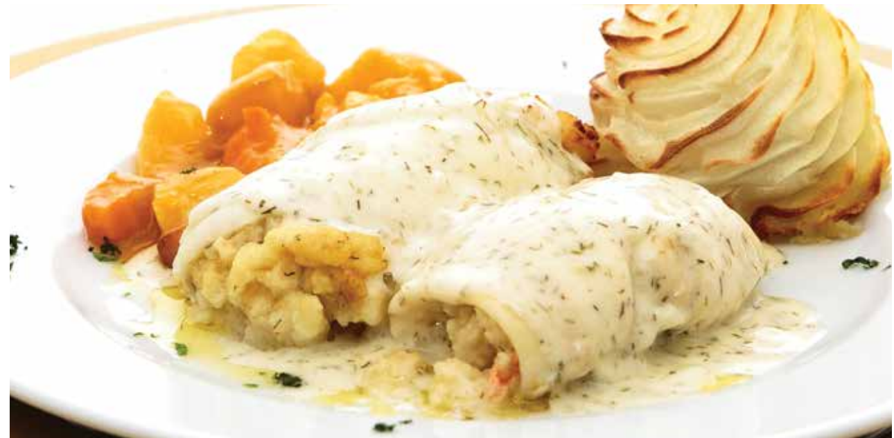
STUFFED FILET OF SOLE