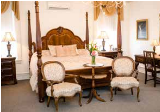
MRS. BOWEN'S ROOM

The Mansion at Bald Hill is a delightful Bed & Breakfast, with six exquisite guest rooms available. The rooms can be viewed on our website at www.mansionatbaldhill.com . A full breakfast is provided for all overnight guests.